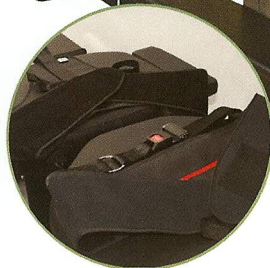
E7100 DOC Strapping System